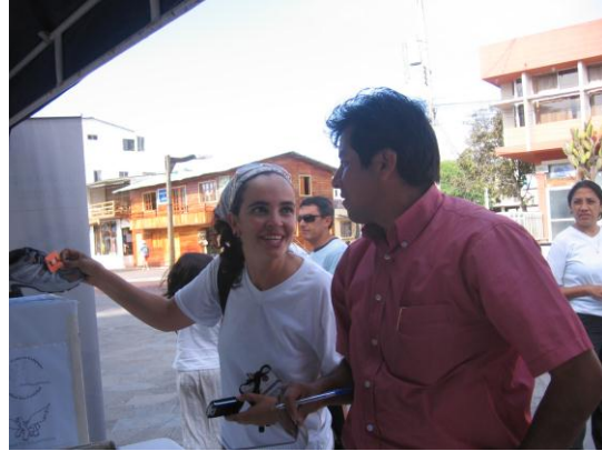
Governor receives his "chip" explanation