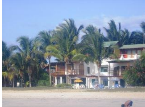
Casa de Marita