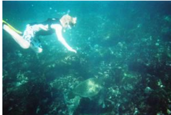
Note ten year old with sea turtle just beyond reach