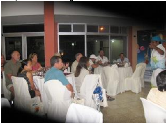
Pasta diner entertainment