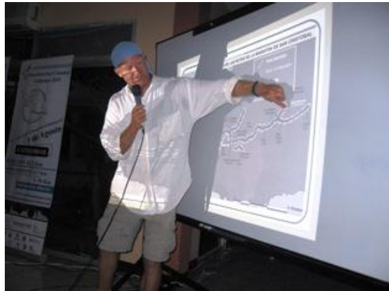
Race director gives final briefing