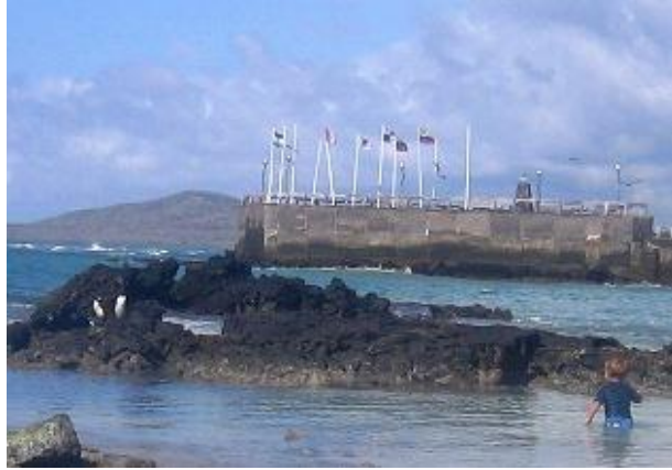
That is my son stalking iguanas and penguins directly in front of the hotel on Isabela