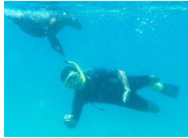
Friendly and curious sea lion pups.