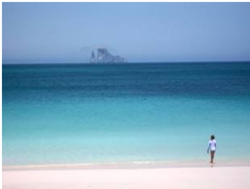
Typical morning, Galapagos

Thur. May 17: All day chartered boat trip to tip of the island and islets. Snorkeling with sharks, rays, turtles and sea lions. Visit nesting grounds of Frigate Birds, Pelicans, Boobies, Tropical birds, etc. Roam gorgeous, deserted, pristine beaches that could make travel posters cry.