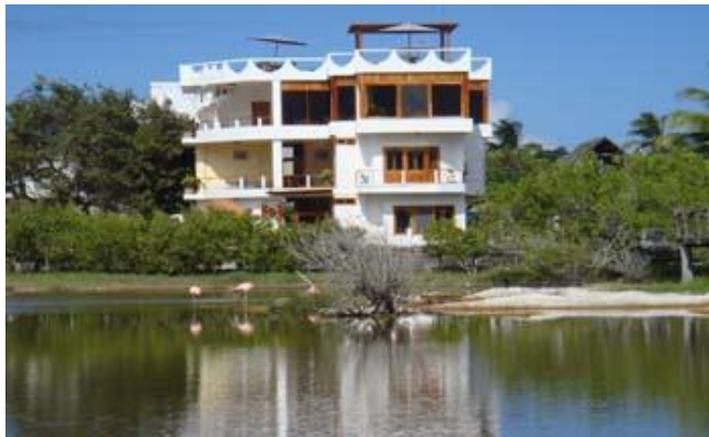
Note Flamingos in front of hotel

Should anyone wish to, Salsa dancing is available some late nights at the local's club where you'll be the only gringos in the place and the locals will likely be buying drinks and showing you some steps.