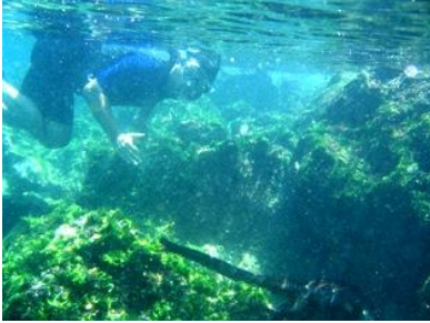
Note sea iguana eating underwater