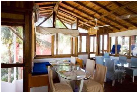
Casa de Marita