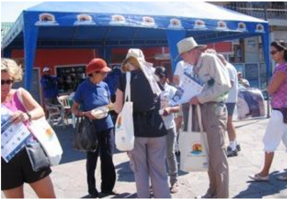
Race registration bibs, chips and pre-race "swag"

Race registration and PM pasta diner photos below.